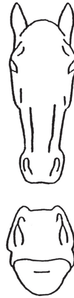
FACE & MUZZLE